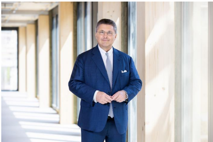
PORR CEO Karl-Heinz Strauss

The press release including high-resolution images is available for download from the PORR Newsroom .