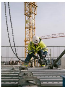
Gesundheit schützen und Talente fördern - für eine bessere Arbeitswelt