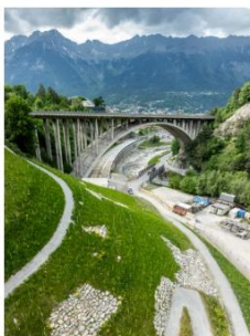
Klima und Ressourcen schützen - für den Erhalt unserer Lebensgrundlage

Als internationales Unternehmen bauen wir für Generationen und prägen Lebenswelten - mit und für Menschen. Nachhaltiges Handeln ist ein wesentlicher Teil unserer gesellschaftlichen Verantwortung und gleichzeitig das Fundament unseres Erfolgs. Es verschafft uns einen klaren Wettbewerbsvorteil und deckt alle ökonomisch, ökologisch und sozial relevanten Aspekte ab.