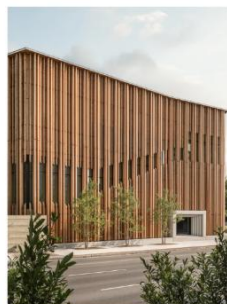
Nachhaltiges Wirtschaften in der Baubranche - für einen langfristigen Unternehmenserfolg